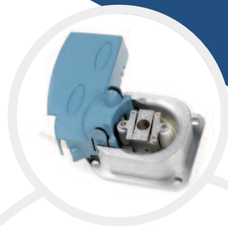
Fluid Removal System Pumping Unit